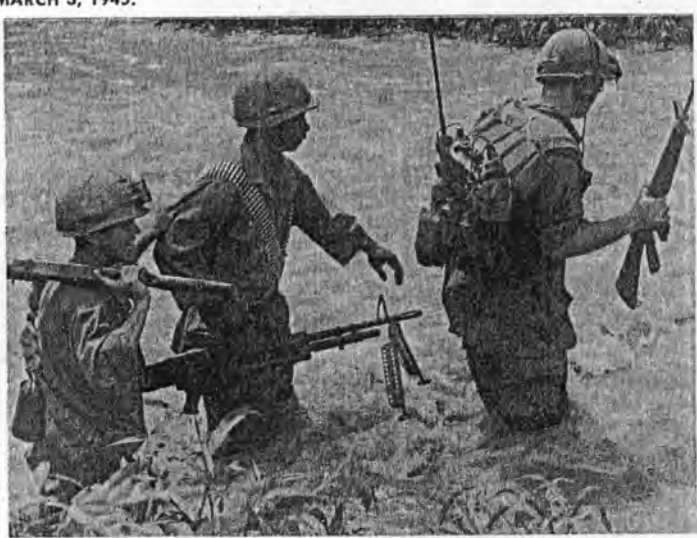
IVYMEN CONTINUE STEADFAST AND LOYAL TRADITION IN VIETNAM.