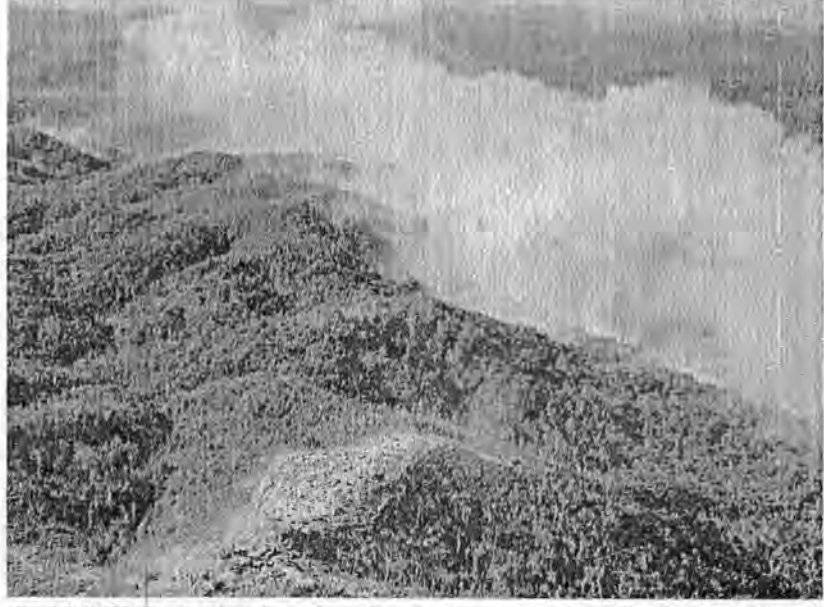
THE BIG CURTAIN—Smoke billows from the mountains as a screen for the evacuation of Firebase 29 near Dak To. The smoke was dropped by Air Force planes to hinder enemy rocket launcher teams shelling the firebase.

His decorations include the Silver Star with two oak leaf clusters, the Legion of Merit, Bronze Star, the Vietnamese Gallantry Cross with palm and the Combat Infantryman's Badge.