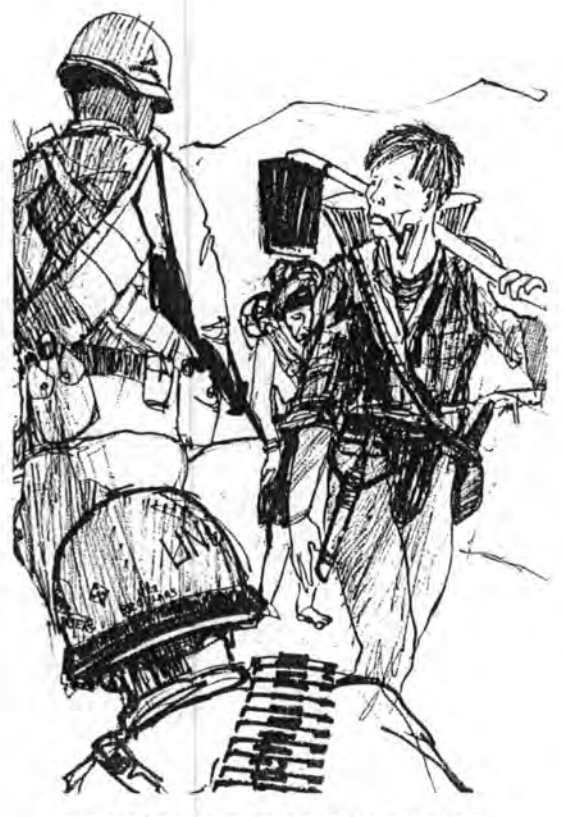
HERITAGE OF HIGHLANDS INSPIRES NICKNAME.