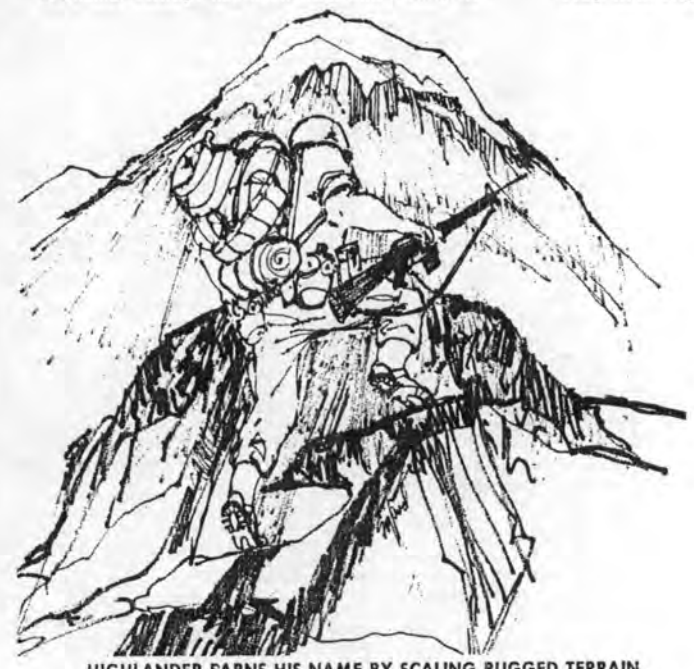
HIGHLANDER EARNS HIS NAME BY SCALING RUGGED TERRAIN.