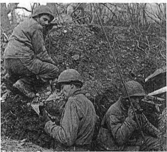
IVYMEN CALL AND CORRECT FIRE MISSIONS IN PRUM VALLEY, GERMANY, MARCH 3, 1945.